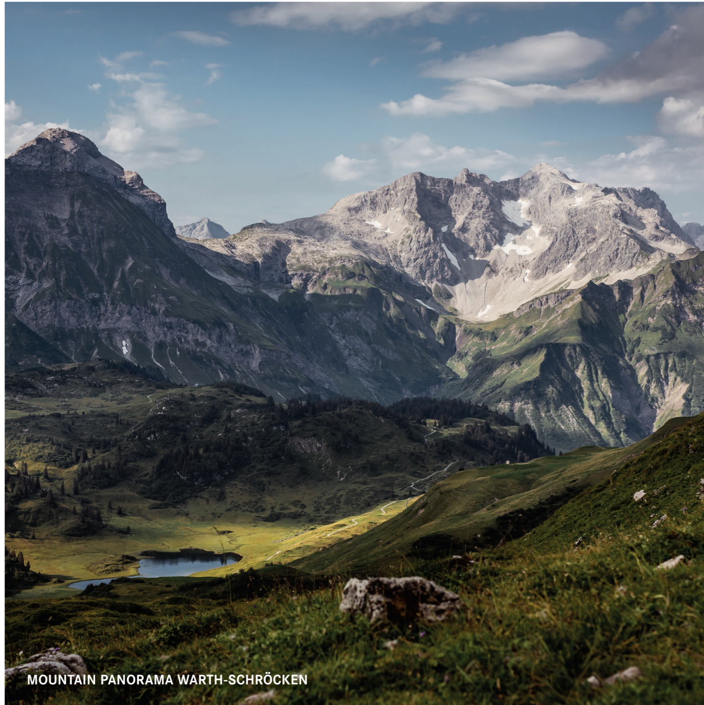
MOUNTAIN PANORAMA WARTH-SCHRÖCKEN