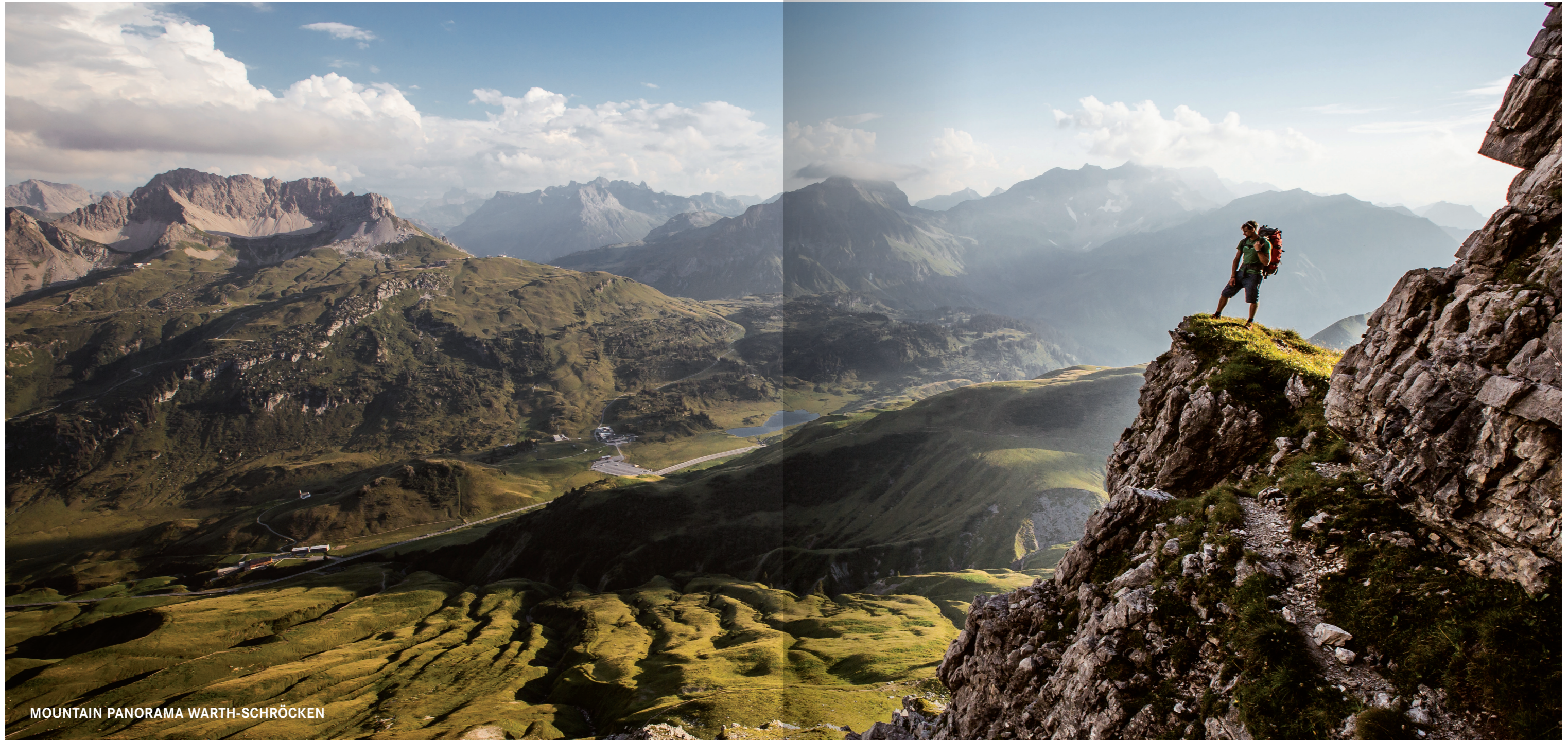
MOUNTAIN PANORAMA WARTH-SCHRÖCKEN