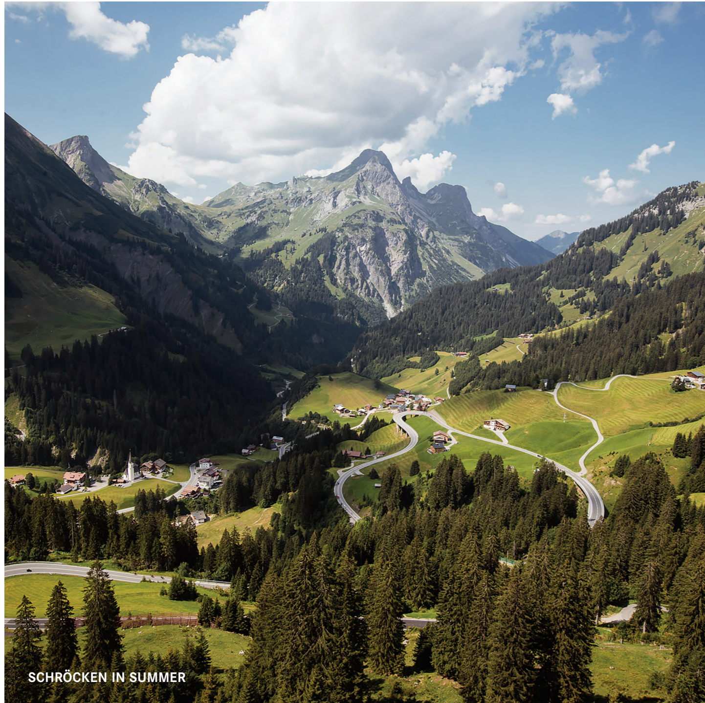
SCHRÖCKEN IN SUMMER