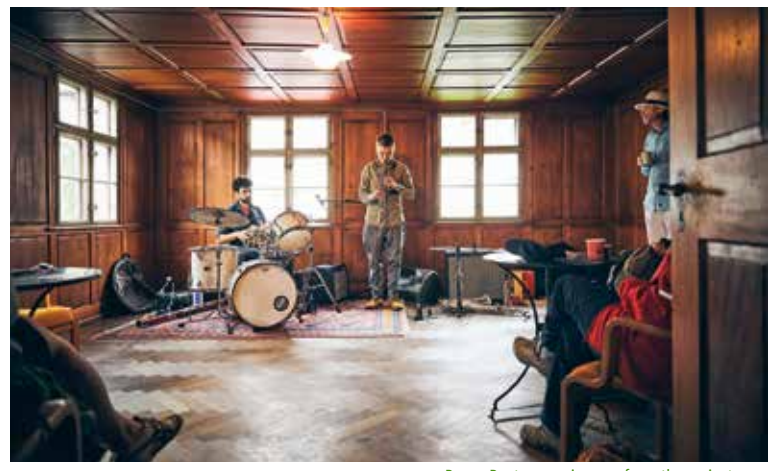
Bezau Beatz - music away from the mainstream