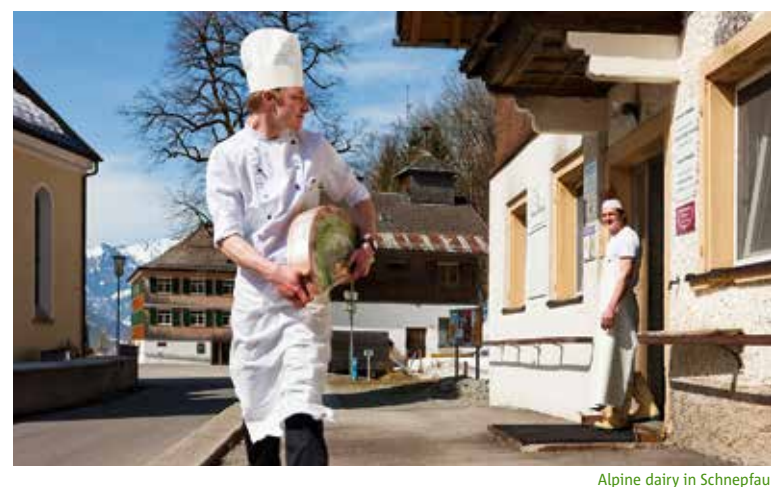
pine dairy in schneplau

How come a valley community in which, a century ago, Sunday dinner comprised a sort of wheat flour mash (with maize grits the rest of the week) is now a gourmet region with specialities whose origins are protected and where refined gastronomy is at home in many restaurants?