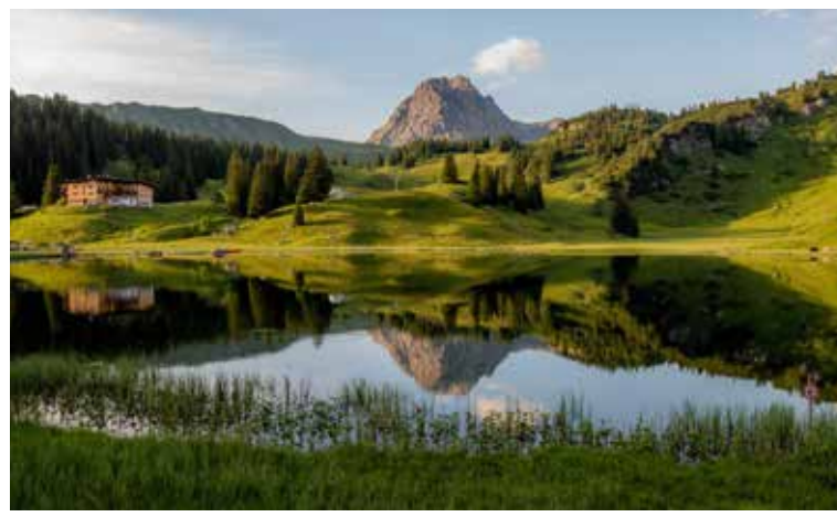
Warth-Schröcken – from lake to lake

The two lakes on the Hochtannberg mountain are your guide on this ramble. The Batzenalpe is a licensed alpine pasture. Here, in the alp museum, you discover what life in earlier times was like. From the Hochtannberg pass, an extended, wide path takes you to the Körbersee, which lies at approximately the same altitude as the Hochtannberg pass. From there, a wide agricultural path takes you downwards across the Batzenalpe to Schröcken.