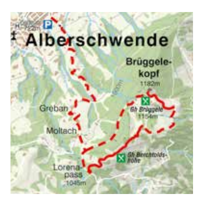
Musical stations at the Brüggelekopf

The Brüggelekopf is Alberschwende's local mountain. The summit presents a magnificent view across the Rhine Valley, Lake Constance and the mountain world of the Bregenzerwald. The Musikwanderweg is a musical hiking trail along which 10 musically structured stations have been installed. Songs that are traditional to the Bregenzerwald – sung and played by Alberschwende choirs and music societies – blend with nature to provide a joyful and harmonious ambience.