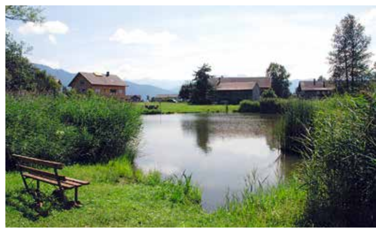
Dörnlesee in Lingenau