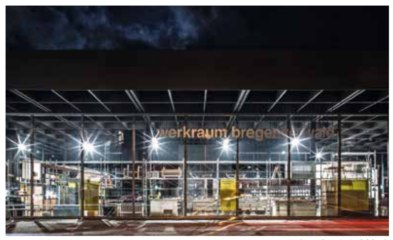
The culture of building and living is everywhere you look in the Bregenzerwald. The locals have been appreciating the artisan production methods employed in small and medium-sized enterprises since way back when.

Nowhere else in Europe will you find such a comparable density of workshops. Work performed in the Werkraum has an international presence, and the innovative craftspeople are in demand both at home and abroad. The Handwerk + Form competition, held every three years for over 25 years now, shows the public how experts from all areas of design cooperate with craftspeople from the Bregenzerwald in order to develop useful objects which do justice to their material and shape. The Werkraum has been running the Bregenzerwald Werkraumschule in conjunction with the Bezauer Wirtschaftsschulen business colleges since 2016 – a pioneering example of how to train people in the skills required for the trades.