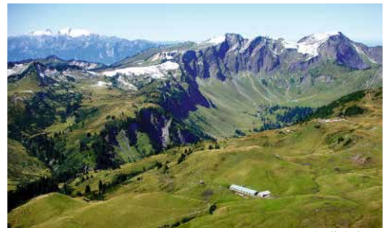
Damüls circular tour