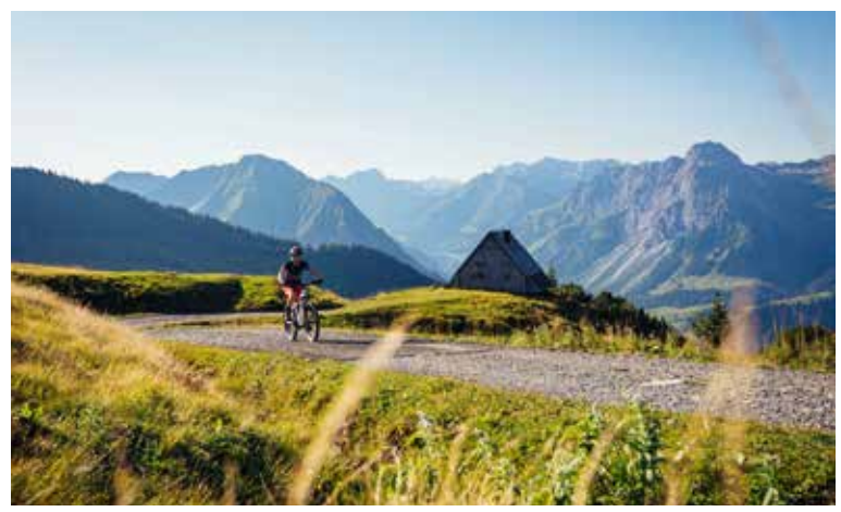
Mountain bike tour in Au-Schoppernau

There is a broad spectrum of cycling tours available, from easy to highly challenging. Cyclists can choose from a total of around 460 km of posted routes. The top 20 tours take visitors through selected beautiful landscapes, to alpine settlements and the High Alps, where the delicious Bregenzerwald alpine and mountain cheese is made. They're a great way of combining tours to summits as well as steep ascents and rapid descents with culinary delights.