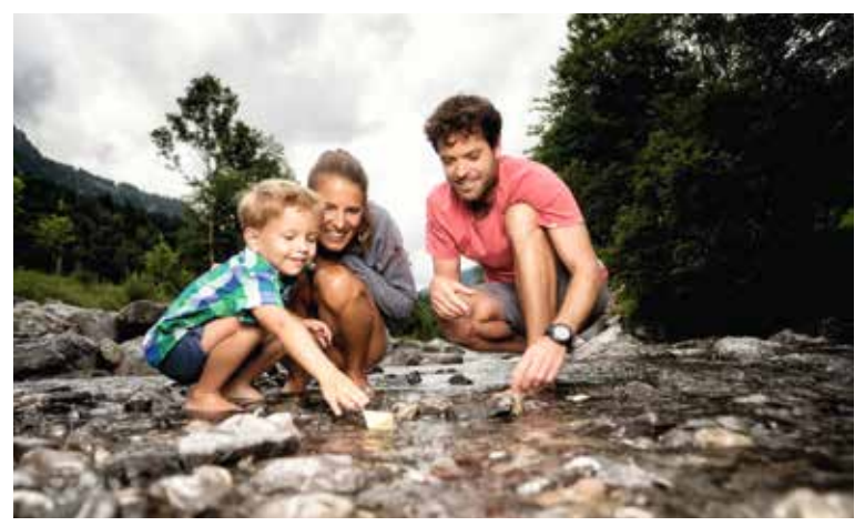
Playing at the Mellenbach