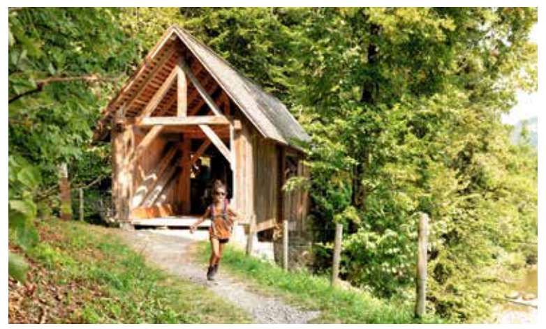
Kommabrücke in Hittisau