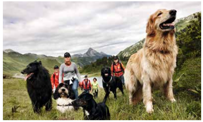
Out and about with dogs