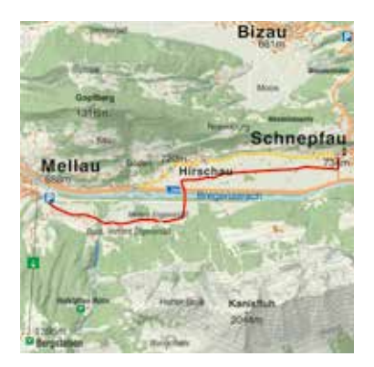
Distance: 10.4 km Condition of the path: tarmacked throughout, more or less level for the most part, with differences in height at stream crossings

Mellau cable cars valley station, Schnepfau village hall (on workdays) BARRIER-FREE CABLE CARS (\rightarrow p. 5)