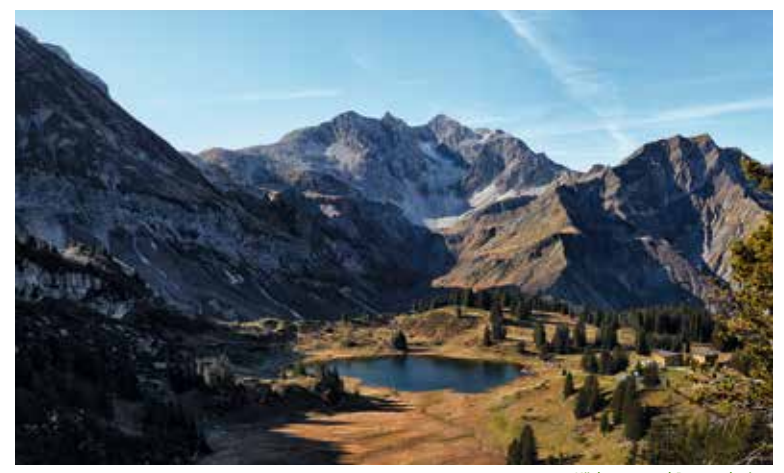
Körbersee and Braunarlspitze