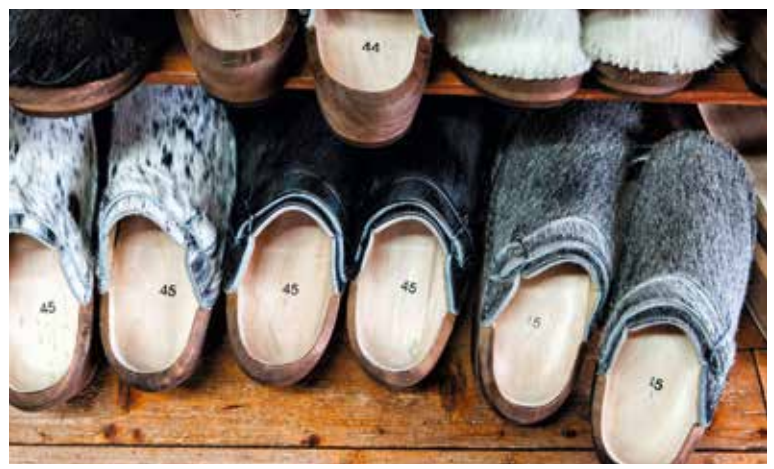
All sorts of specialist craft items are created in workshops and studios. Items made by expert craftspeople and artisans are available in a number of shops, generally straight from the producers.