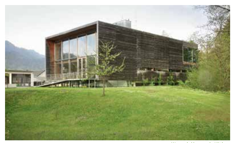
Women's Museum in Hittisau

Insights into the history, lifestyle and creative activity are provided by lively museums and exhibitions.