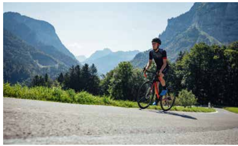
Racer tour close to Schnepfau

The Bregenzerwald is the perfect region for racers since they can choose from routes with different degrees of difficulty.