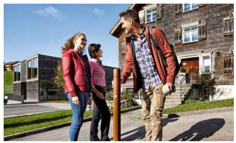
Information boards along the trails of the "Umgang Bregenzerwald" tour