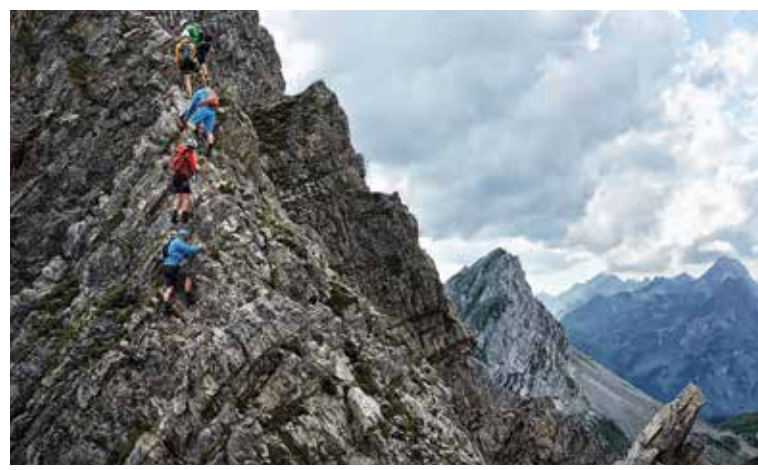
Karhorn via ferrata

The Bregenzerwald outdoor specialists offer playful and adventurous activities pertaining to the topic of mountain and water.