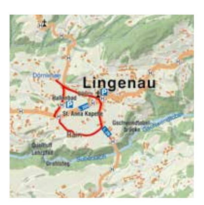
Distance: 3 km Condition of the path: pavements and roads with little difference in height, all tarmacked

Lingenau village square (685 m) – Gschwend – St. Annakapelle (669 m) – Vitalhotel Quellengarten – Dörnlesee – village square; signposted as a yellow-white rambling path BARRIER-FREE REFRESHMENTS & WC Hotel Löwen, Gasthaus Traube, Vitalhotel Quellengarten SWIMMING POOL Vitalhotel Quellengarten, Lingenau T +43 (0)5513 6461-0 www.bregenzerwaldhotels.at