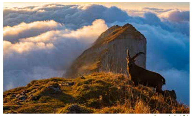
Ibex on the Kanisfluh