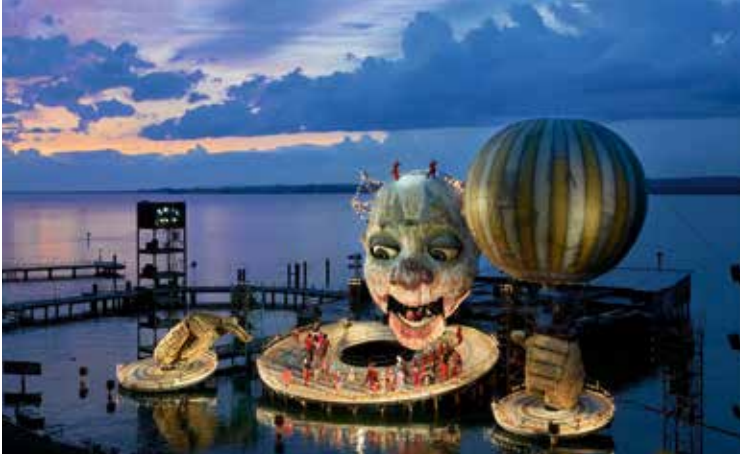
Performance on the lake