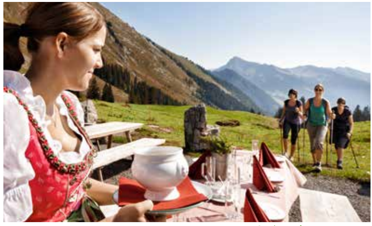
Step by step from course to course

Step by step from course to course. The hikers are walking through the cultural landscape that typifies the Bregenzerwald: gently rolling alpine meadows, steep slopes, rocky walls and impressive views. They stop for breakfast, lunch and dessert in selected inns that particularly value regional and seasonal products. There are five impressive walking routes to choose from.