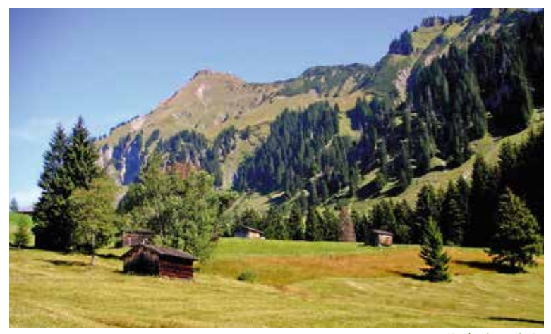
Hay landscape in Au