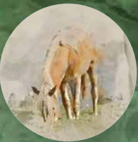
37 · Haflinger Stud Farm