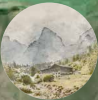
11 · Kaisergebirge nature experience