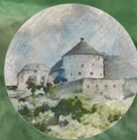
1 · Kufstein Fortress