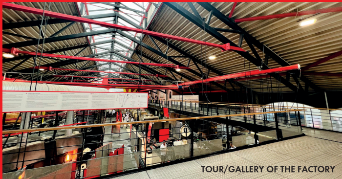
TOUR/GALLERY OF THE FACTORY