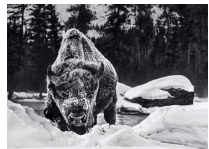
BUFFALO SOLDIER, 2021