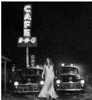
AMERICAN BEAUTY, 2021