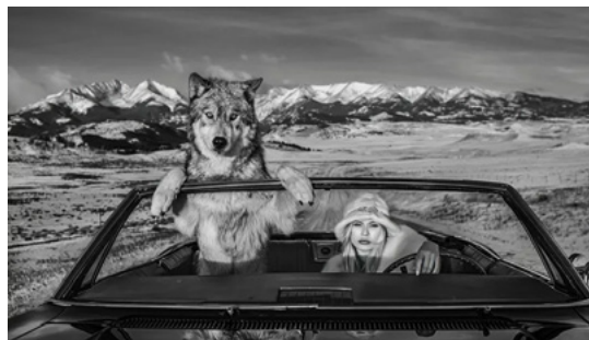
ONCE UPON A TIME IN THE WEST, 2019