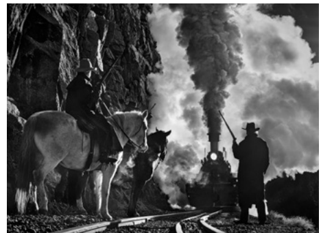
IRON HORSE II, 2021