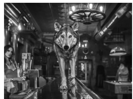
FRIDAY NIGHT AT THE PIONEER, 2021