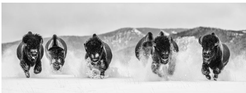
THE BILLS II, 2021