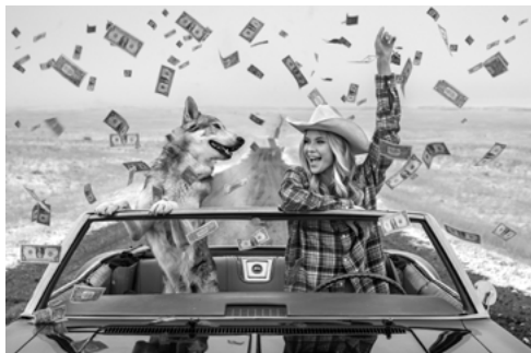
FARGO - (JOSIE), 2020