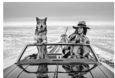
ON THE ROAD AGAIN, 2020