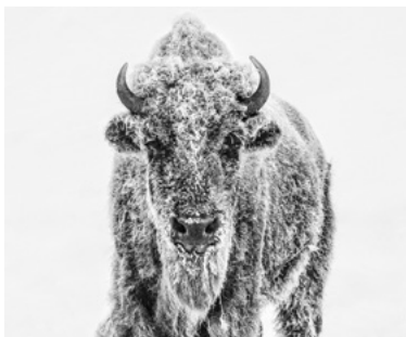
ICE AGE, 2019