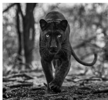
REMAINS OF THE DAY, 2021