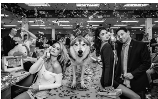
THE WOLVES OF WALL STREET II, 2021