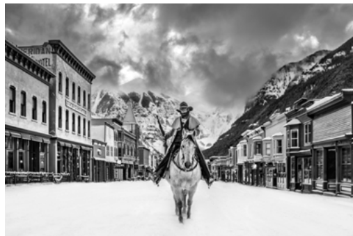
GO WEST YOUNG MAN, 2021