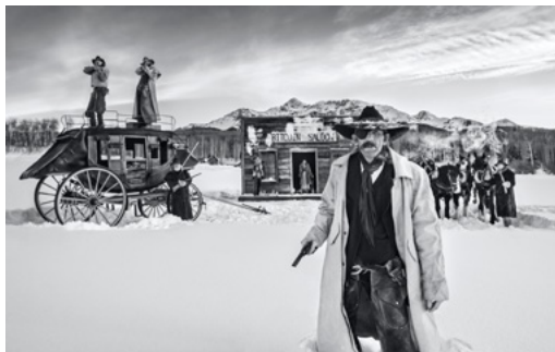
NO CURRENCY, 2021