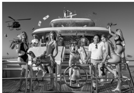
GET THE F*** OFF MY BOAT II, 2021